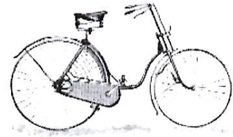
1885 – Chain Driven Bicycle

1. Bicycles are an excellent choice when it comes to transportation. Biking is healthy and faster than walking, but it is also dangerous. Each year tens of thousands of people are killed or injured while riding a bicycle. This is because our roads are designed for motorists and not cyclists, but we can change the landscape. Each time a road is built or rebuilt, we should put in bike lanes. Clearly marked bicycle lanes will give cyclists a safer place to ride. Our cyclists deserve this little bit of consideration. In fact, their very lives are depending on it.